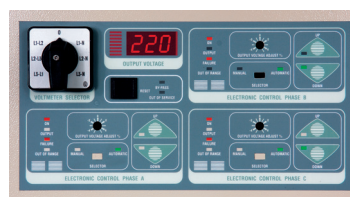
► Three phase equipment synoptic (Independent phase regulation)