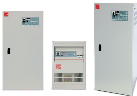
► EMi models