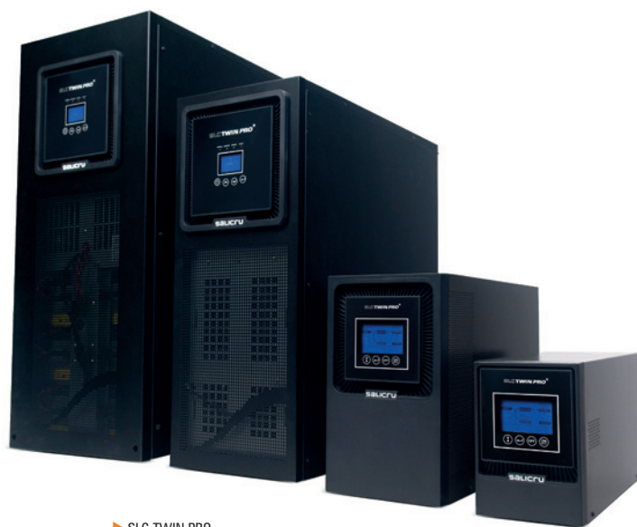
► SLC TWIN PRO