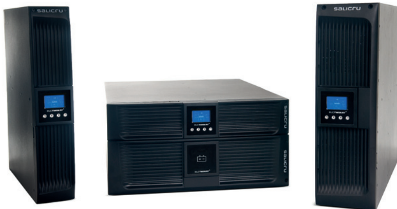
► SLC TWIN RT