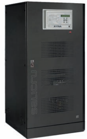
► SLC X-TRA 100 kVA