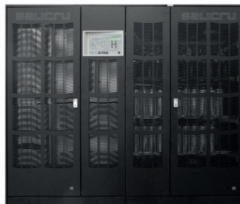
► SLC X-TRA 600 kVA