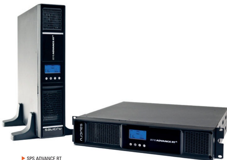
► SPS ADVANCE RT